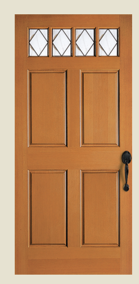
QUEEN ANNE® IV

4242 door with brass caming. Privacy Rating 7.