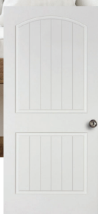
Ovolo Raised Panel 80465 with V-groove Option