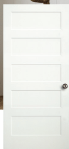
Shaker Flat Panel 8755