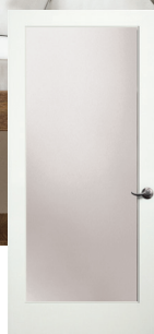
Ovolo French 8001