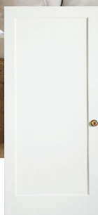
Ovolo Flat Panel 8020