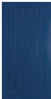
49812 Shown in Dress Blues