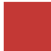
SW 6869 Stop Red