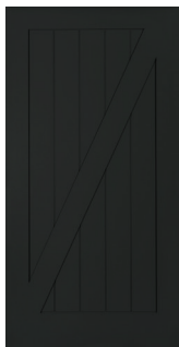
49812 Shown in Tricorn Black