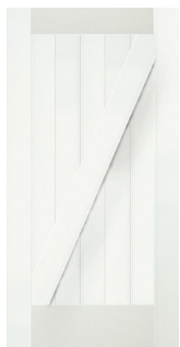
49812 Shown in High Reflective White