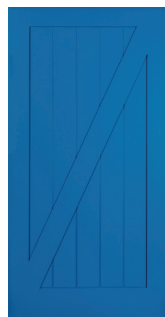
49812 Shown in Blue Chip

*Since no two pieces of wood are the same, the look of the clear and gray finishes can vary slightly from the images shown here.