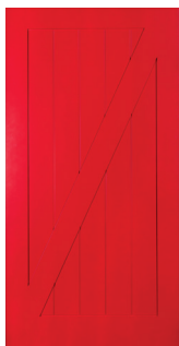
49812 Shown in Stop Red