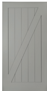
49812 Shown in Ellie Gray