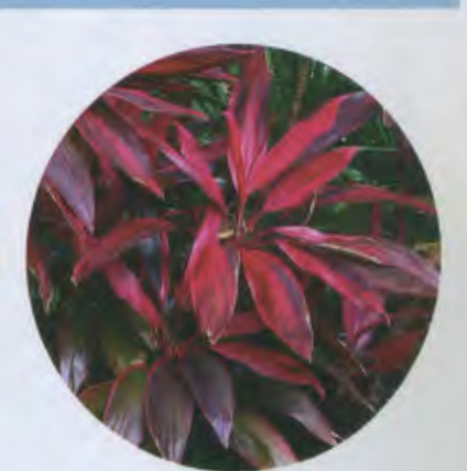
flapjacks hawaiian ti plants