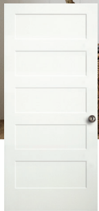
Shaker Flat Panel 8755