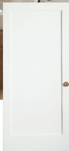
Ovolo Flat Panel 8020