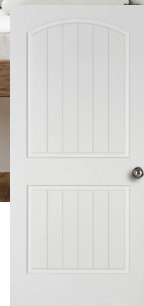
Ovolo Raised Panel 80465 with V-groove Option