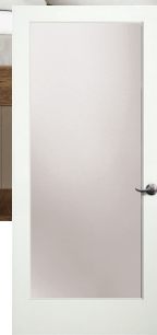
Ovolo French 8001