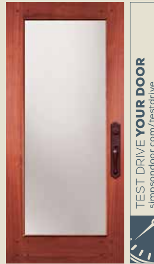
77002 Shown in sapele mahogany