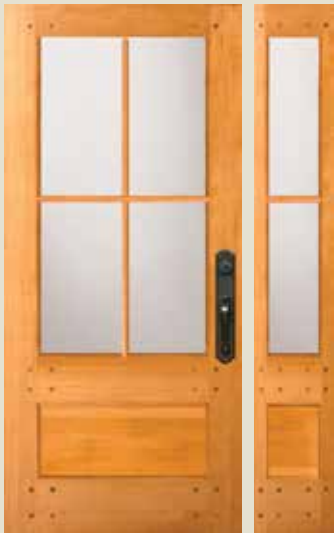
77504 FP Shown in Douglas fir with 77802 sidelight