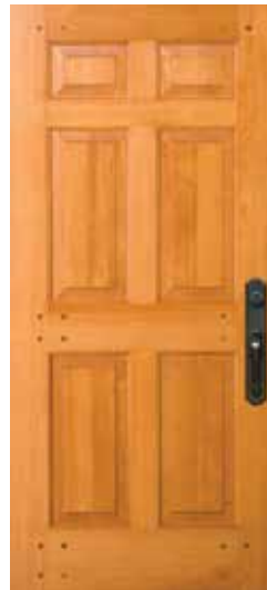
77130 RP Shown in Douglas fir