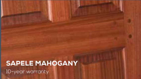
SAPELE MAHOGANY 10-year warranty