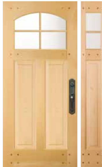
77684 RP Shown in nootka cypress with 77663 sidelight