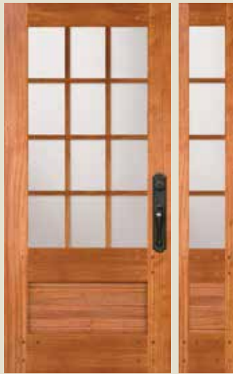
77512 FP Shown in sapele mahogany with 77804 sidelight and optional shaker sticking