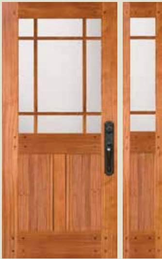
77943 FP Shown in sapele mahogany with 77843 sidelight and optional shaker sticking