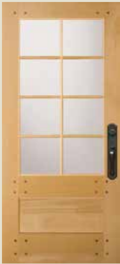
77508 FP Shown in nootka cypress