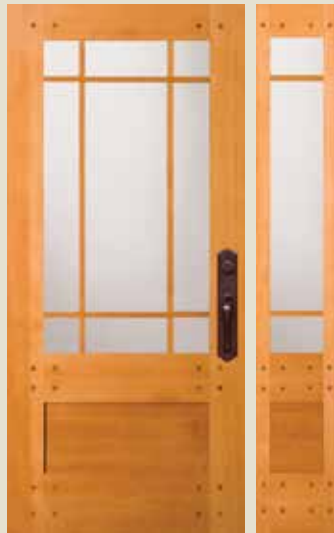
77598 FP Shown in Douglas fir with 77599 sidelight and optional shaker sticking