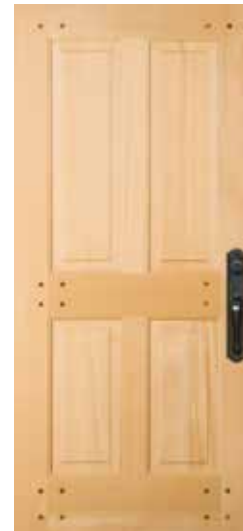
77144 RP Shown in nootka cypress