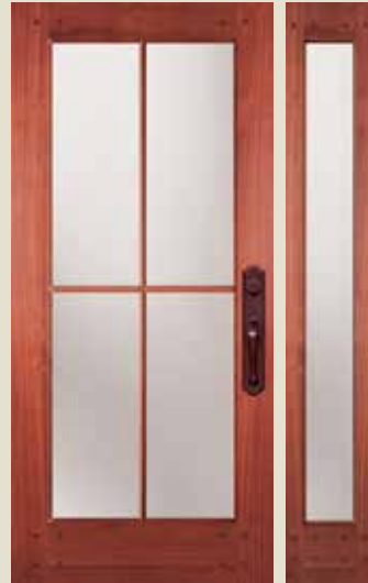
77122 Shown in sapele mahogany with 77701 sidelight