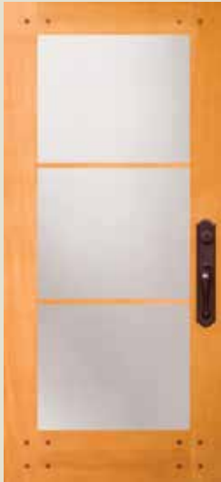
77103 Shown in Douglas fir with optional shaker sticking