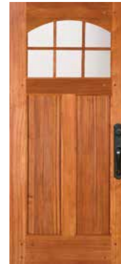
77660 FP Shown in sapele mahogany with optional shaker sticking