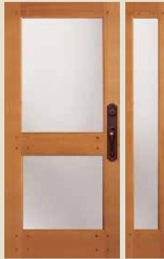
77082 Shown in Douglas fir with 77701 sidelight