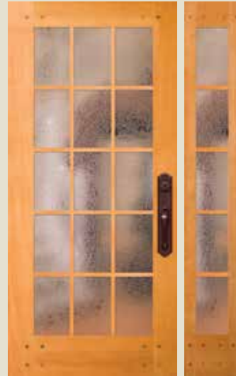
77015 Shown in Douglas fir with 77705 sidelight and optional shaker sticking and glue chip glass. Privacy Rating 6.