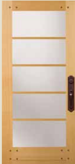
77105 Shown in nootka cypress with optional shaker sticking