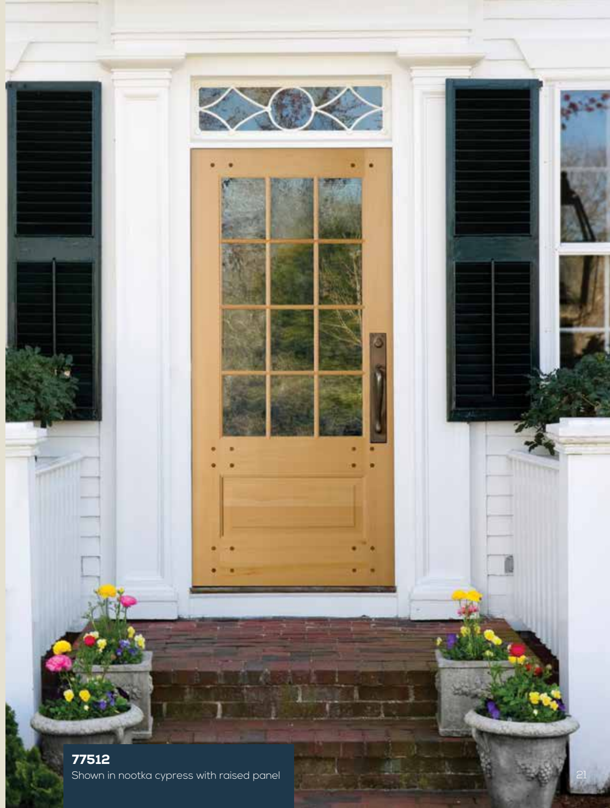
77512 Shown in nootka cypress with raised panel