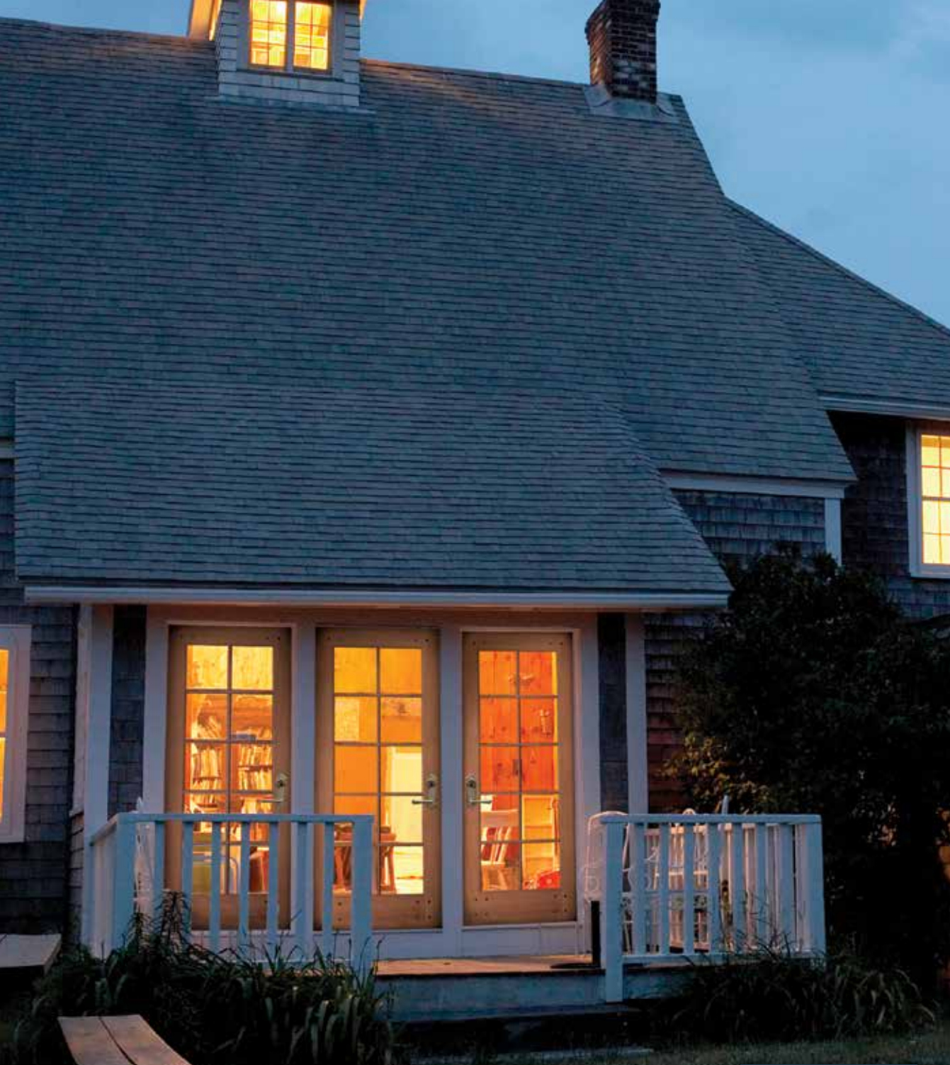
77010 Shown in Douglas fir