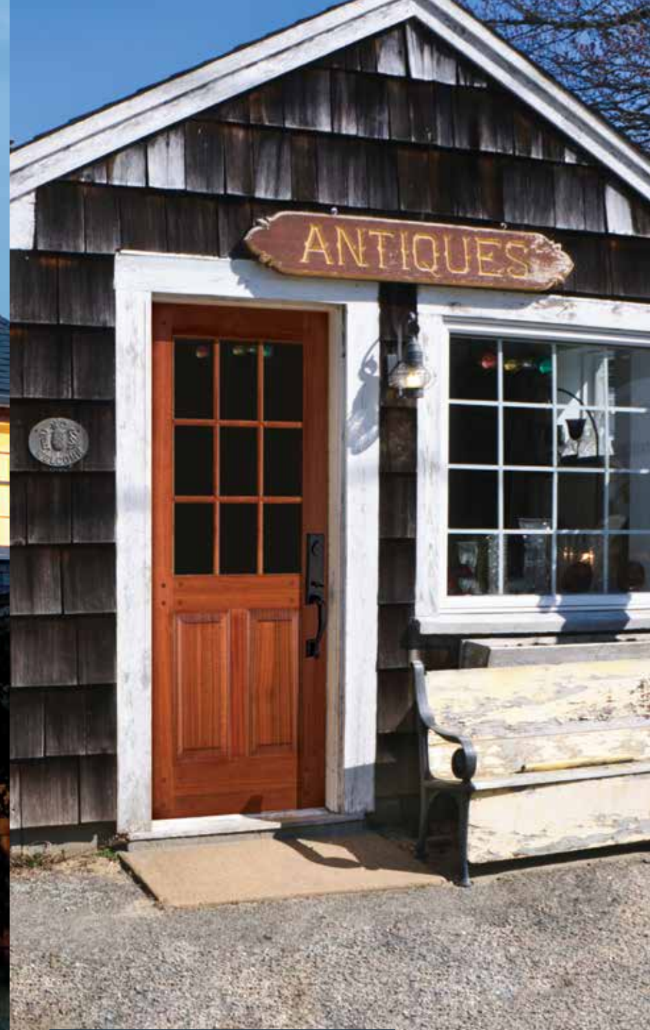
77944 Shown in sapele mahogany with raised panels