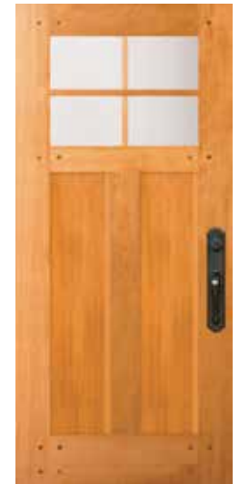
77664 FP Shown in Douglas fir with optional shaker sticking