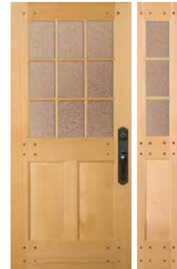
77944 FP Shown in nootka cypress with 77703 sidelight and optional P-516 glass. Privacy Rating 5.