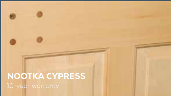
NOOTKA CYPRESS 10-year warranty