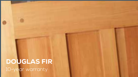
DOUGLAS FIR 10-year warranty