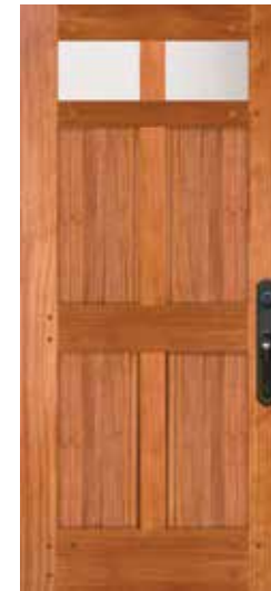
77132 FP Shown in sapele mahogany with optional shaker sticking