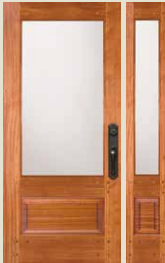
77501 RP Shown in sapele mahogany with 77801 sidelight